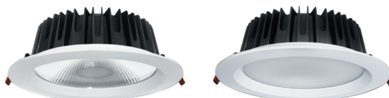
ND191, ND193 ND195, ND197